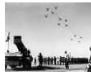
Diamond formations of Edwards aircraft starred in finale of "Toward the Unknown"