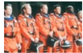
Several scenes from Touchstone Pictures' "Armageddon" was filmed at Edwards AFB