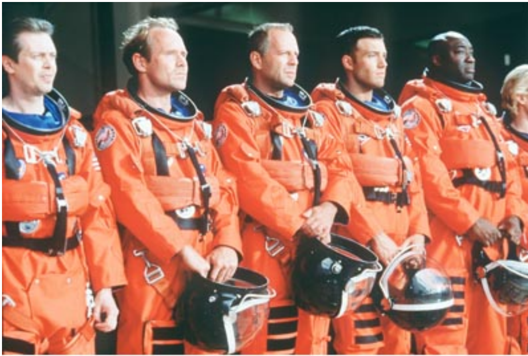
The cast of Touchs tone's "Armageddon" includes (from left) Steve Buscemi, Will Patton, Bruce Willis, Ben Affleck, Michael Duncan and Owen Wilson. Several scenes were filmed at Edwards Air Force Base.