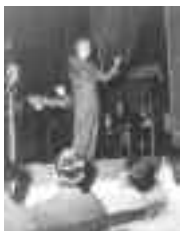
Jack Benny at the Edwards AFB theater