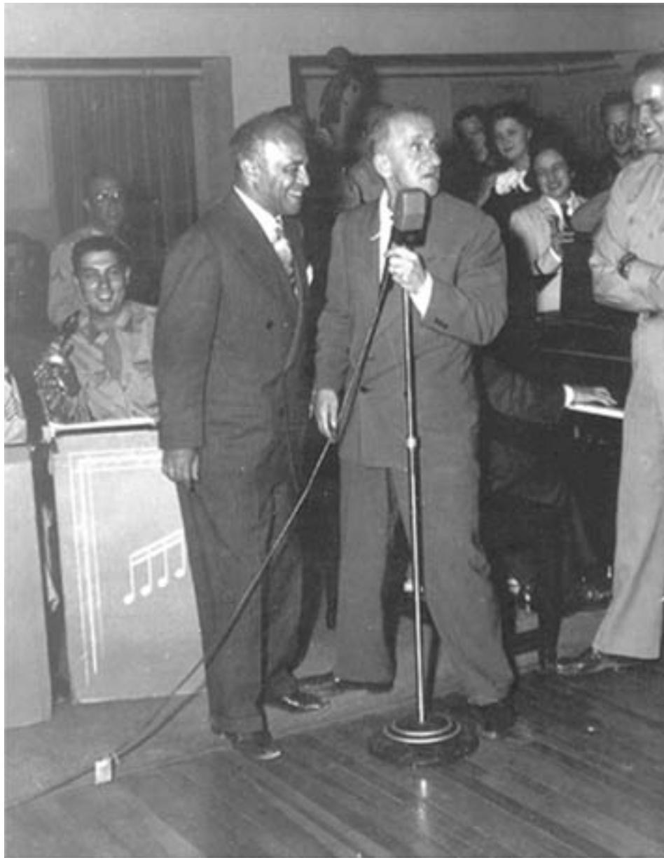
Jimmy Durante and Bill Robinson (top dancer) at O Club