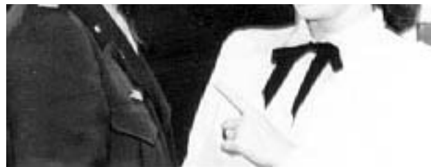
Capt. Glen Edwards and Joan Leslie

In the February 1946 issue of Movieland , it is reported that "Joan's still never too tied-up to entertain service men in military camps, in hospitals, and in her own home. That Burbank house is a week-end mecca for visiting GI's, and she entertains simply and graciously with badminton bouts, ping-pong, home-made cookies and pleasant chatter. Her popularity with men in uniform is, they claim, because she's 'so much like the girl next door.'"