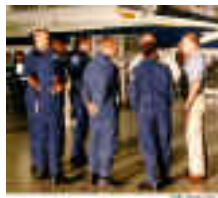
Stars of "Deep Impact" film a scene at NASA-Dryden