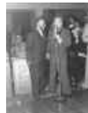
Jimmy Durante at the Officer's Club