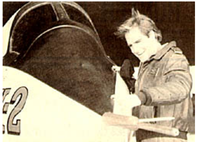
Scott Bakula of "Quantum Leap" pictured at Edwards AFB with a mock-up of the X-2

Other various and sundry productions occurred about this time. The series "Steve Canyon" (1958-60) starring Dean Fredericks, brought the comic strip character to television. A photo in the Edwards History Office archives captures a scene shot on the lakebed.