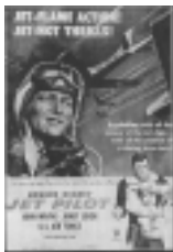
Poster for the movie "Jet Pilot" starring John Wayne

* Click on thumbnails to see the full size version.