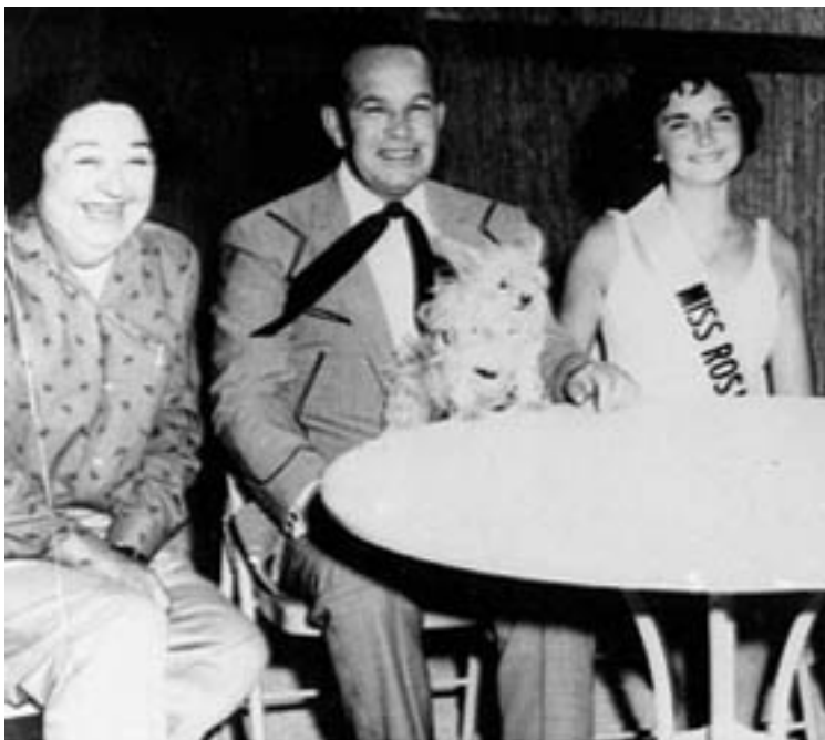
Pancho Barnes, pictured with TV personality Spade Cooley and Shirley Rabe, "Miss Rosamond," 1959

Motion picture companies would often rent the whole ranch for filming, including all of the rooms, plus making use of the airport, ranch, restaurant, bar and rodeo grounds.