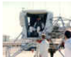
Bryan Cranston, portrays astronaut Buzz Aldrin in lunar module for "From the Earth to the Moon"