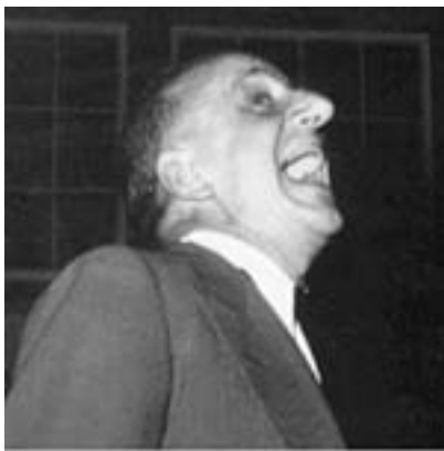
Jimmy Durante at Edwards

Boosting morale was important with a war going on, and the entertainers of the day took the job seriously.