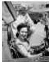
Linda Darnell in a P-38 cockpit