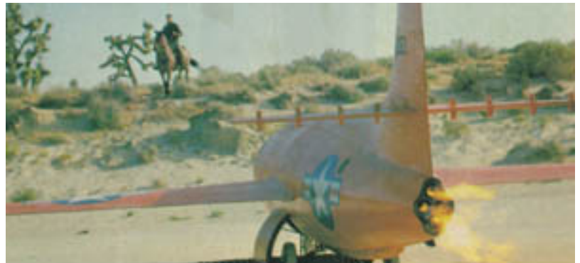
Sam Shepard, portraying Capt. Chuck Yeager in "The Right Stuff," rides toward the X-1

Although Chuck Yeager never went into space, Wolfe considered his historic supersonic flight to be mankind's first step on the way to orbital flight. Thus, the first third of the film version revisits the X-1 era in loving (and somewhat exaggerated) detail: dusty Muroc air base, dashing test pilots, Pancho's place, the orange rocket plane and a laconic Chuck Yeager (played by Sam Shepard), broken ribs and all.