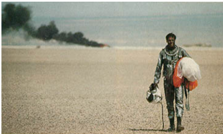
Sam Shepard, portraying Capt. Chuck Yeager in "The Right Stuff," escapes from a fiery crash

The picturesque quality of the dry lakes, their isolation and singularity have attracted Hollywood production companies since the 1920s – making it one of the film industry's favorite back lots.