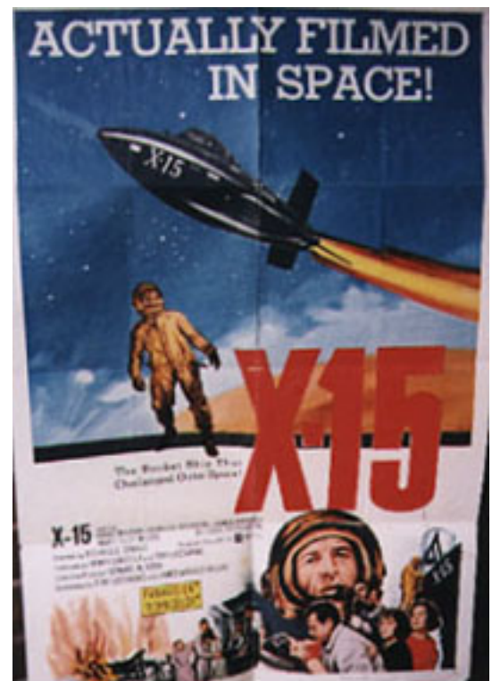
Movie poster for "X-15"

Although the evil Nazis and deadly kamikazis had disappeared, the emerging Cold War soon furnished America's Hollywood warriors with a new set of dastardly opponents: steely-eyed Communist agents, hyper-advanced Russian fighters, and the overwhelming strength of the Soviet Air Force.