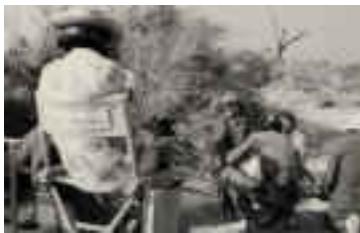
Jack Palance and director John Badham during filming of "The Godchild"