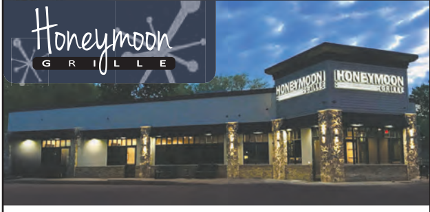
DINNER SERVICE BEGINS AT 4 PM

ALL NEW WEEKLY FEATURES FILET ~ SALMON OSCAR STUFFED CHICKEN BREAST