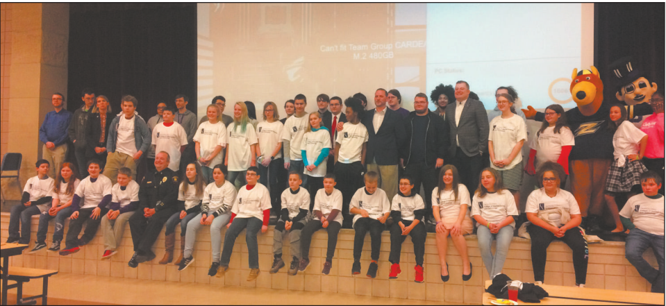
Zippy and Magic Man join the cybersecurity program during the open house at Barberton Middle School.